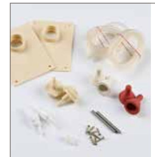
M003005 Minisuckler Unit with Steel tube