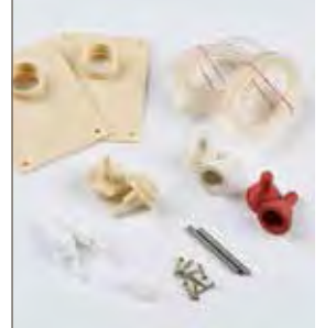
M003005 Minisuckler Unit with Steel tube