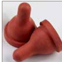
M004020 Red lamb teat (hard)