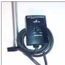
A071758 Heater complete with thermostat