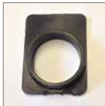
A071789 Black rubber seal old heater