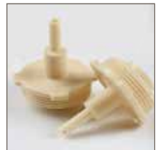
M001708 Minisuckler connector