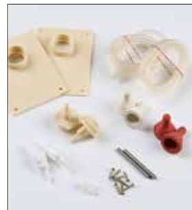
M003005 Minisuckler Unit with Steel tube