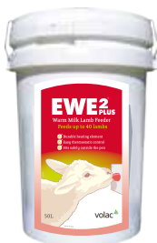
A071786 EW2 PLUS outer bucket