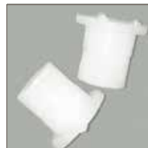
M017220 Minisuckler filter (white)