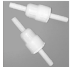
M001235 Minisuckler Non-return valve