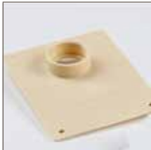
M001706 Single backplate