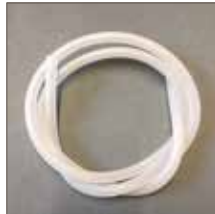
M174021 Silicone tubing for EW2 PLUS