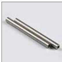
M174079 Metal tube for minisuckler