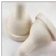
M004015 White lamb teat (soft)