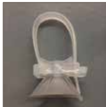
A071760 Suction pad Old heater